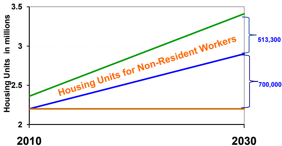
Washington Metropolitan Area Housing Requirements, 2010-2030

While the current forecasts show that the Washington metropolitan area is only expected to house 66 percent of its future workforce, housing 700,000 new households raises additional challenges. In order to house these 700,000 new household will require constructing an average of 35,000 new housing units annually for twenty years. To date, the metropolitan area has never added this many housing units in a single year. And even if the metropolitan area does succeed in expanding its housing stock to accommodate two-thirds of its future work force, this achievement will not have addressed the new housing needed to house new workers coming to the area to back fill jobs being vacated by retiring workers, many of whom in their retirement will not have vacated their current house or apartment.